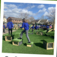
Get Set, GO! Blocks