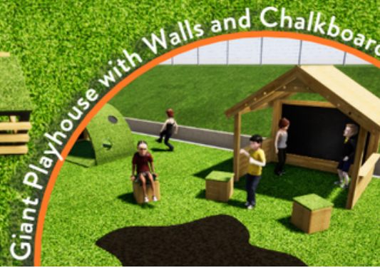
Giant Playhouse with Walls and Chalkboard