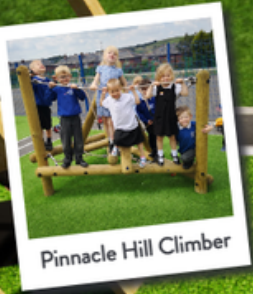
Pinnacle Hill Climber